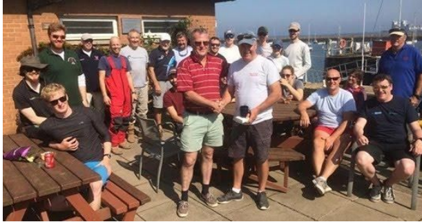
More-T-Vicar winners of the RFYC One-design