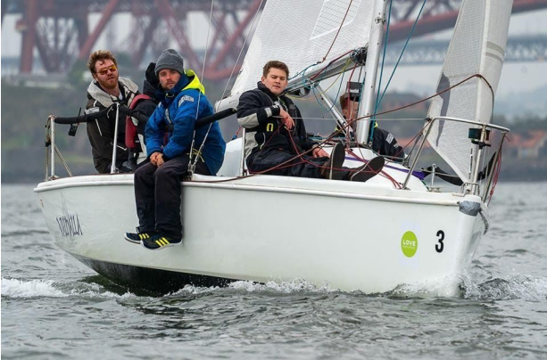
Valhalla – 2 nd in two events. If only they could retain that consistency....actually if only we all could!